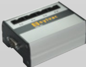
MB-4D : Digimatic probes