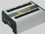
MB-8D : Digimatic probes