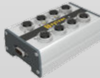
MB-8i : Inductive probes