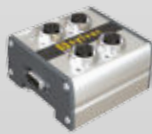
MB-4C : Capacitive probes