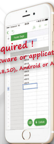
Feeler Gage transmitting data via HID mode to Excel for iOS