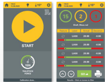
New easy to use touch screen operator interface.