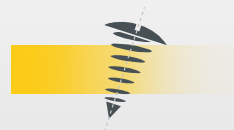
Exclusive helix tilting system by Sylvac, for more comprehensive thread measurements.